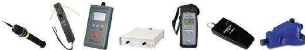
From left to right: Fiber continuity tester, fiber identifier, light source, OTDR launch box, fiber optic power meter, visual fault locator, fiber optic inspection microscope

There is a broad range of testing equipment and handheld devices for the measurement of attenuation, some just for specific connectors, fibers and wavelength, and others with adapters for different kind of cables. The decisions for a test kit depends on the types of fiber used in the various applications, e.g. if only multimode cables transmitting 850 nm light waves are used or the ability of testing monomode cables is necessary as well. A test kit for measuring the attenuation should be sufficient to decide whether the transmission capacity of a cable is okay. For more detailed analyses, other test equipment such as an Optical Time Domain Reflectometer (OTDR) can be used.